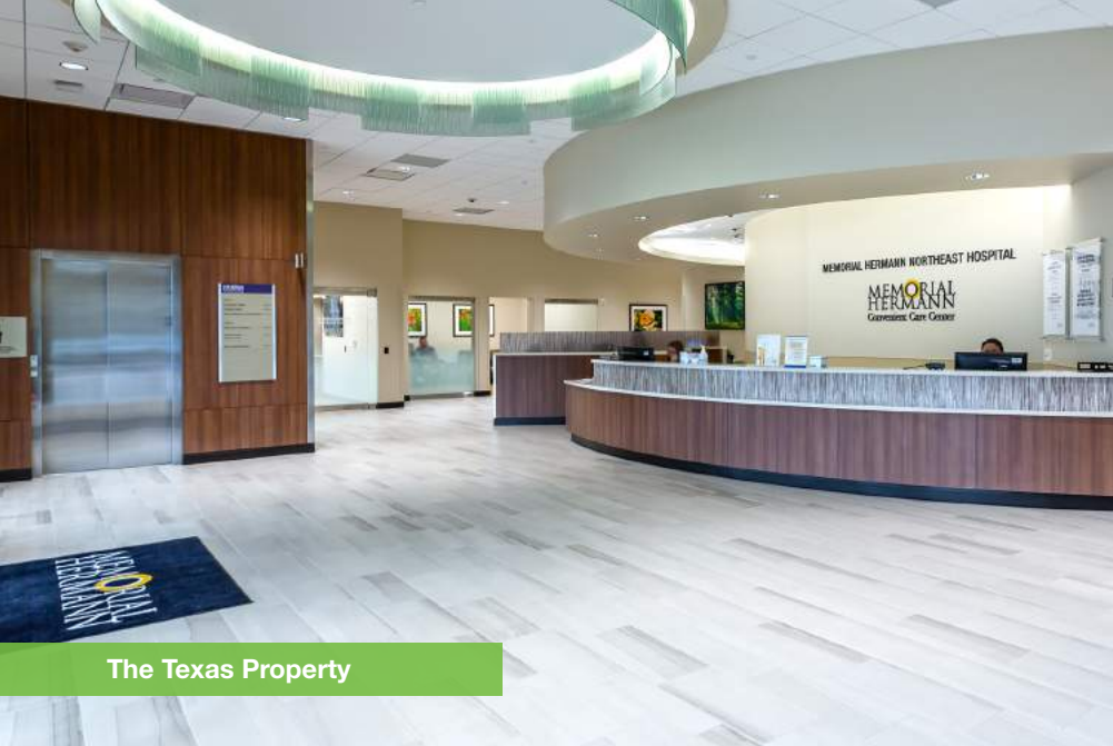
The Texas Property