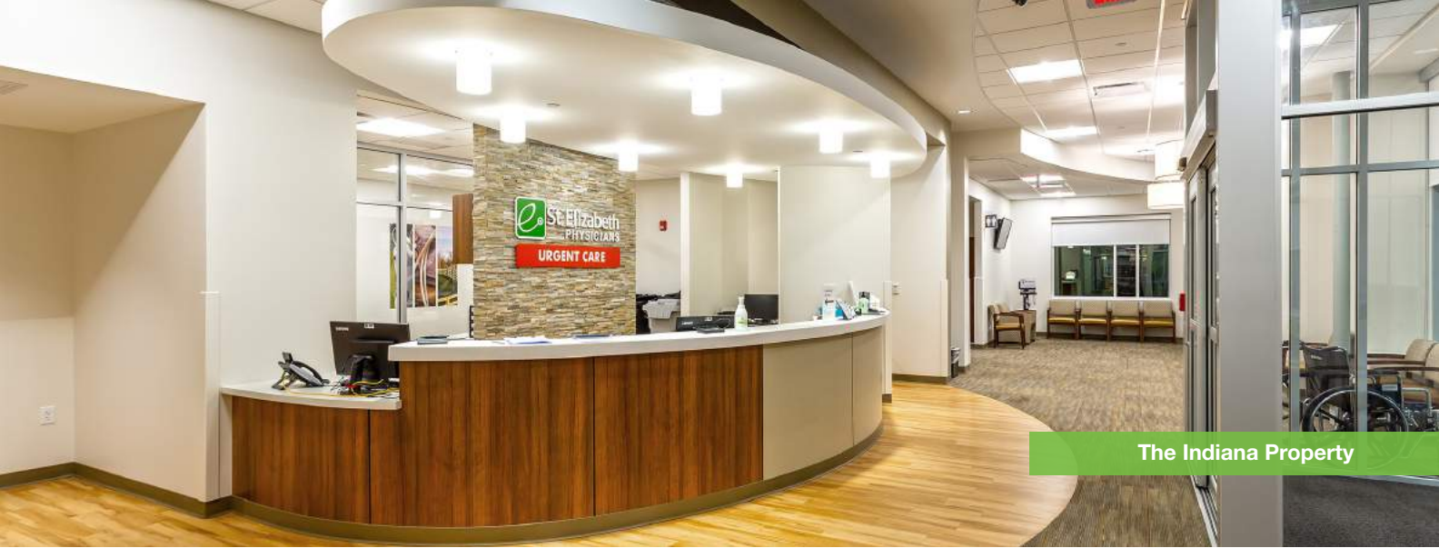
The Indiana Property