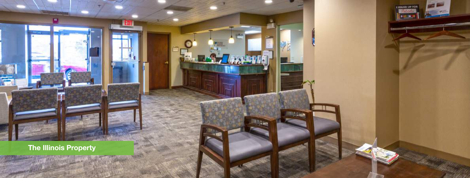
The Illinois Property