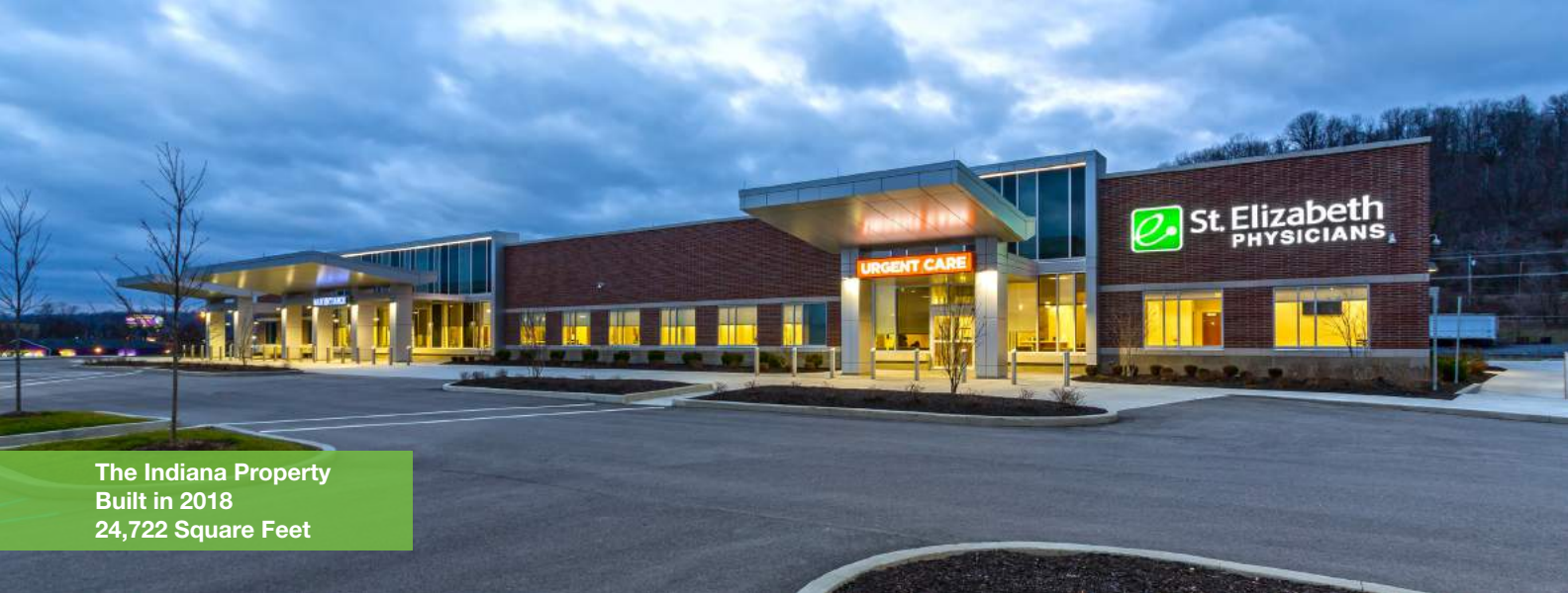
The Indiana Property Built in 2018 24,722 Square Feet